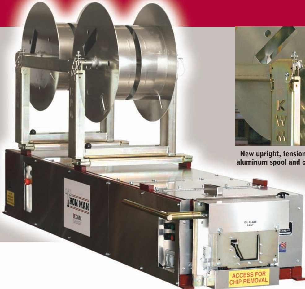
New upright, tension brake, aluminum spool and coil scale