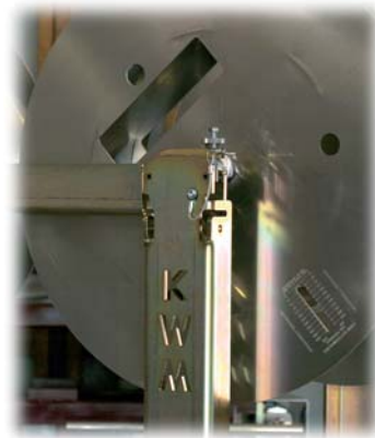
Innovative upright design reduces friction at upright wear-point